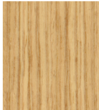
Rift Cut White Oak

All Classic's wood products are finished with a 100% solid UV-cured sealer, followed with a clear water-borne UV anti-microbial top coat — all with zero VOC's applied — and at no additional cost.